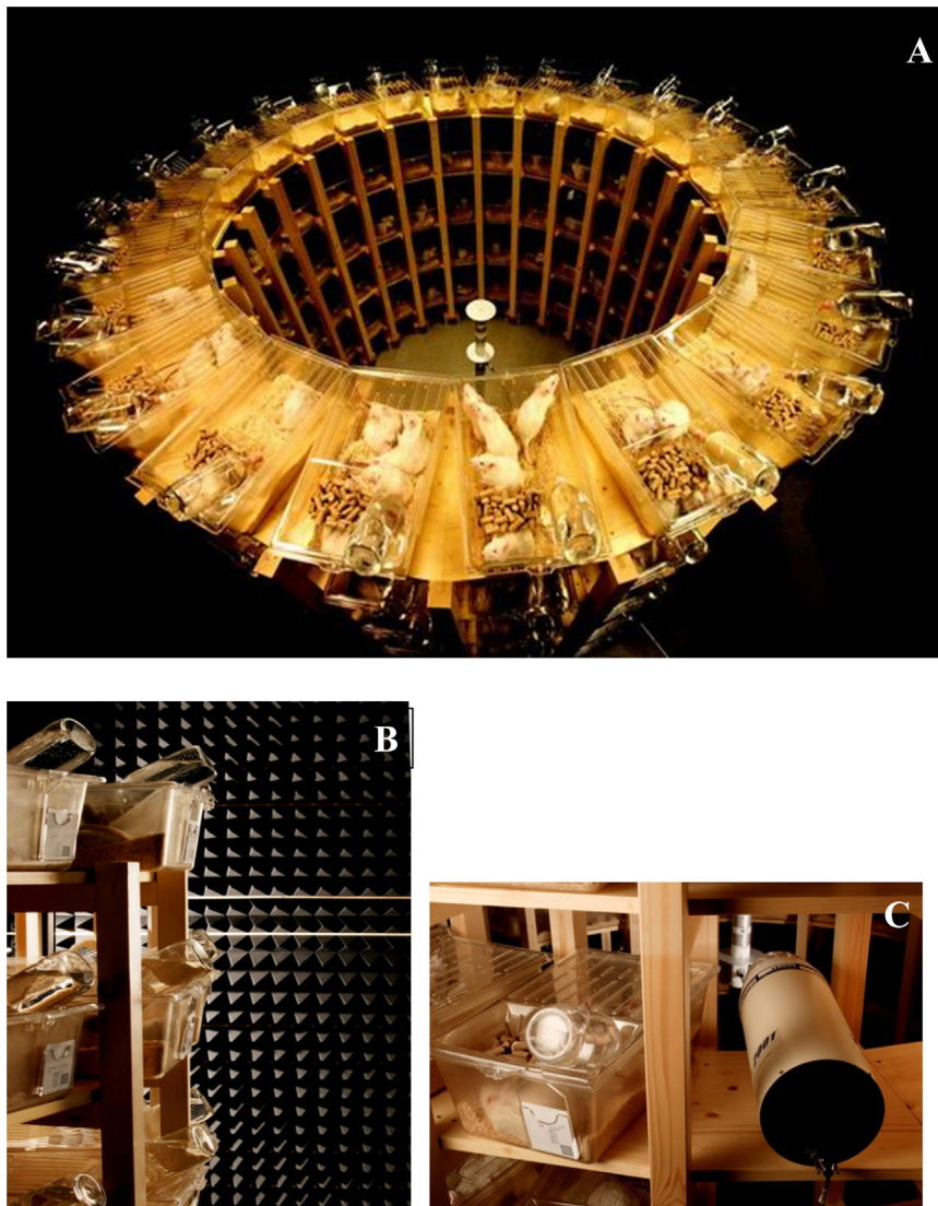
Fig. 1. RI study on 1.8 GHz base station RFR: exposure system. The rat cages were located in wooden circular-shaped devices, as in a sort of condominium. Each single exposure device served at least 400 rats (A). The exposure rooms were totally shielded in order to minimize the effect of field non-uniformity due to reflection and consequent interference caused by the walls (B). Detail of the RFR feedback probe used to measure the field (TESY2001 field sensor) and of the animal cage with methacrylate markers, cover and mangers (C).

produce the following functions: a) generate a GSM signal, with complete channel simulation capability and frequency preselection; b) signal pre – amplifications – age, with gain regulation input; c) final stage, dimensioned for a total power output of plus 50 dBm; d) reference signal loop back input, for closed loops power control; the control was closed at the antenna connection level in order to stabilize at the maximum level the radiation unit RF feed; e) power supply unit; f) cooling unit for continuous use of the device.